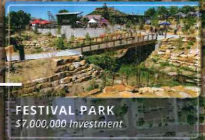
FESTIVAL PARK $7,000,000 Investment