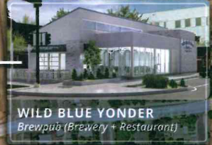
WILD BLUE YONDER Brewpub (Brewery + Restaurant)