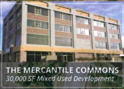
THE MERCANTILE COMMONS 30,000 SF Mixed Used Development