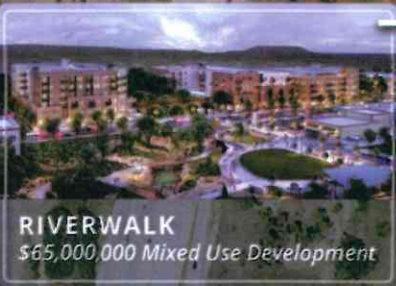
RIVERWALK $65,000,000 Mixed Use Development