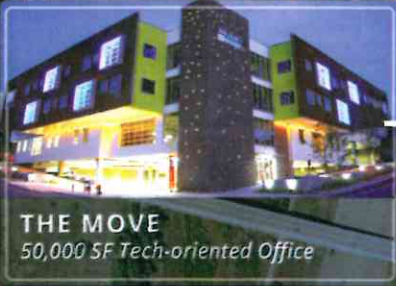
THE MOVE 50,000 SF Tech-oriented Office