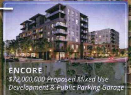
ENCORE $72,000,000 Proposed Mixed Use Development & Public Parking Garage